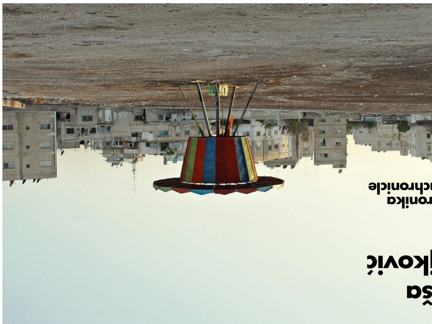
Siniša Vlajković / Anakronika / Anachronie