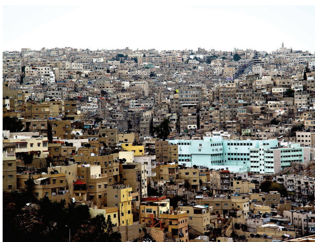
Rhapsody in Shocking Blue, Amman, Jordan, 2008