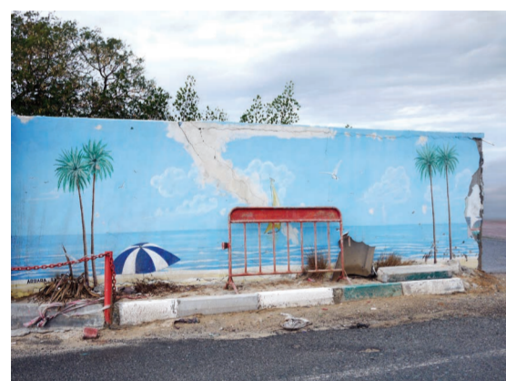
▲ The Drawing on the Wall, Ajman, UAE, 2011