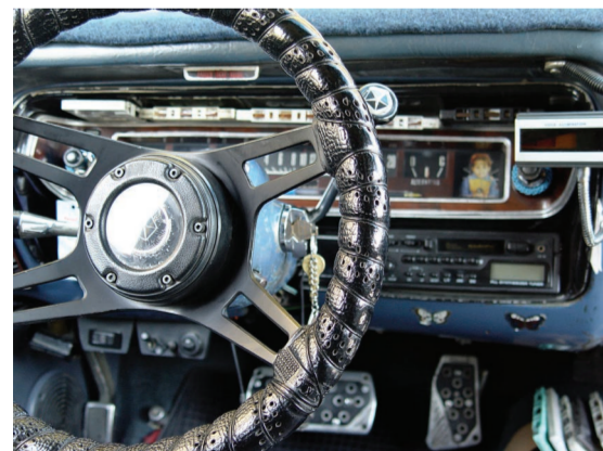
▲ Taxi Cockpit, Chitoura, Lebanon, 2004