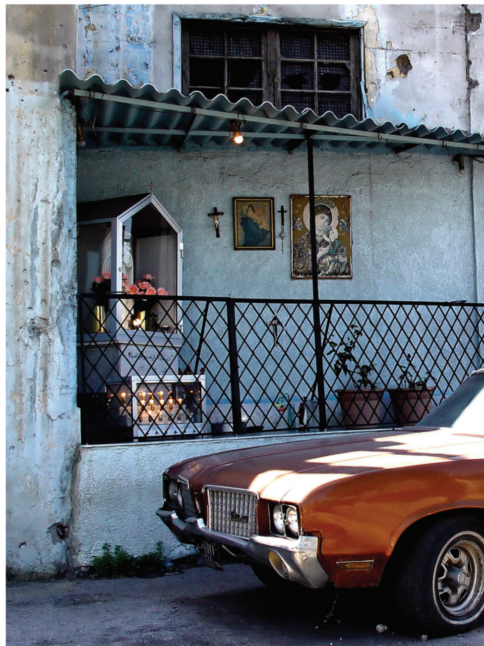
Drive-thru Chapel, Beirut, Lebanon, 2004