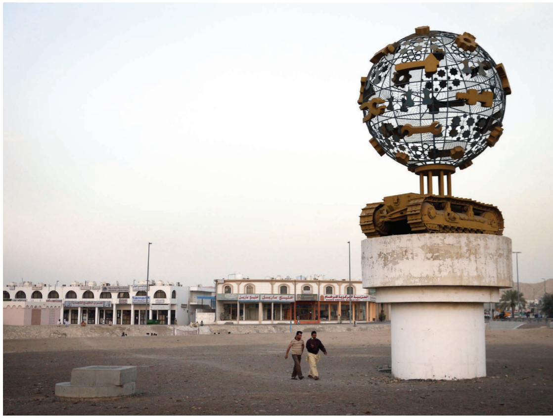
▲ Tank Top, Al Ain, UAE, 2002