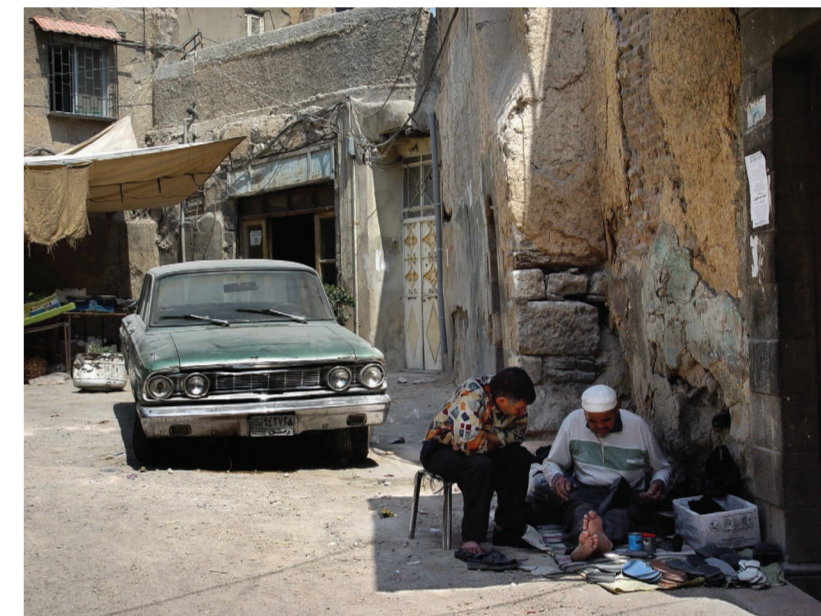
▲ Shoemaker, Damascus, Syria, 2004