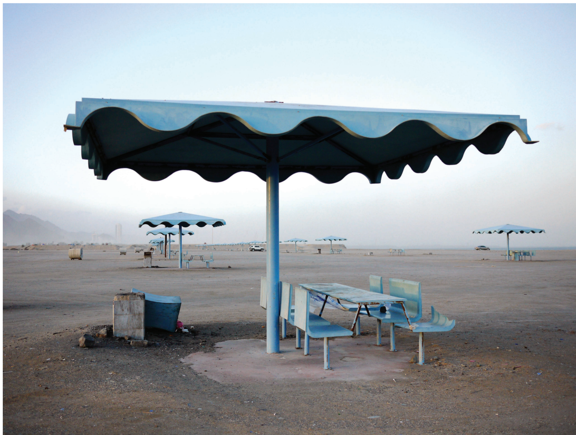
▲ Les Parasoles de Fijatahā, Fujairah, UAE, 2011