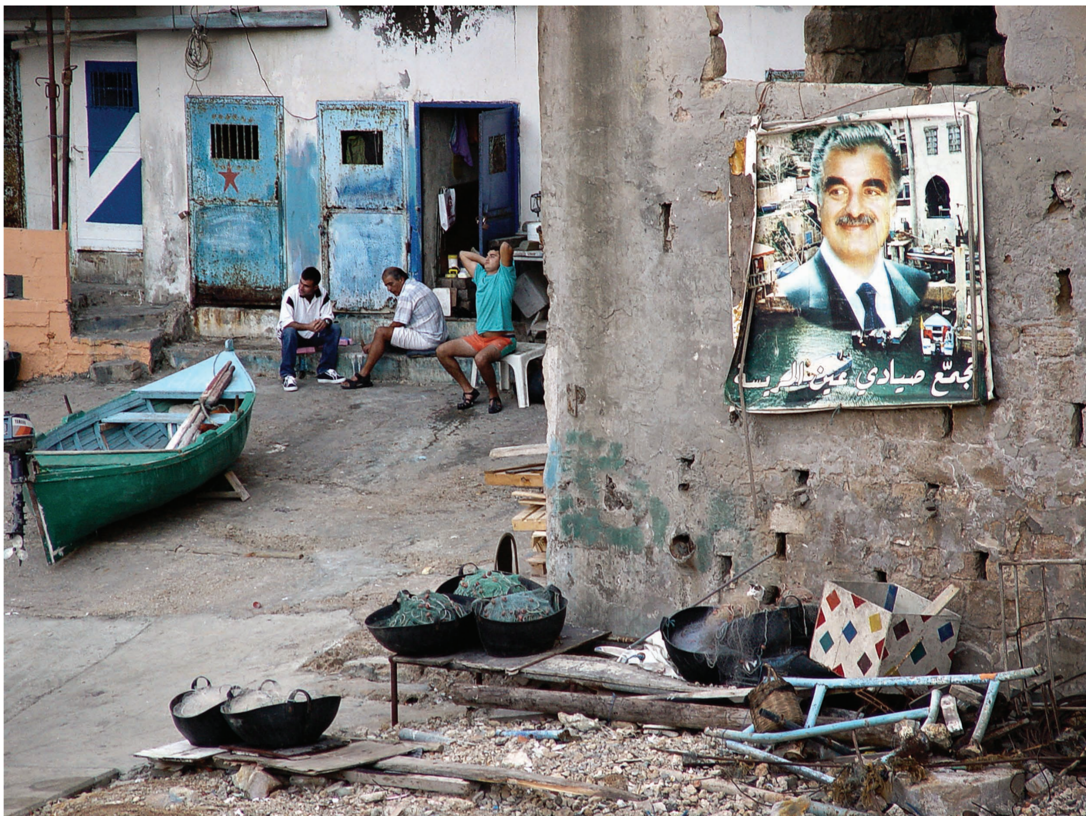
▲ Siesta, Beirut, Lebanon, 2003