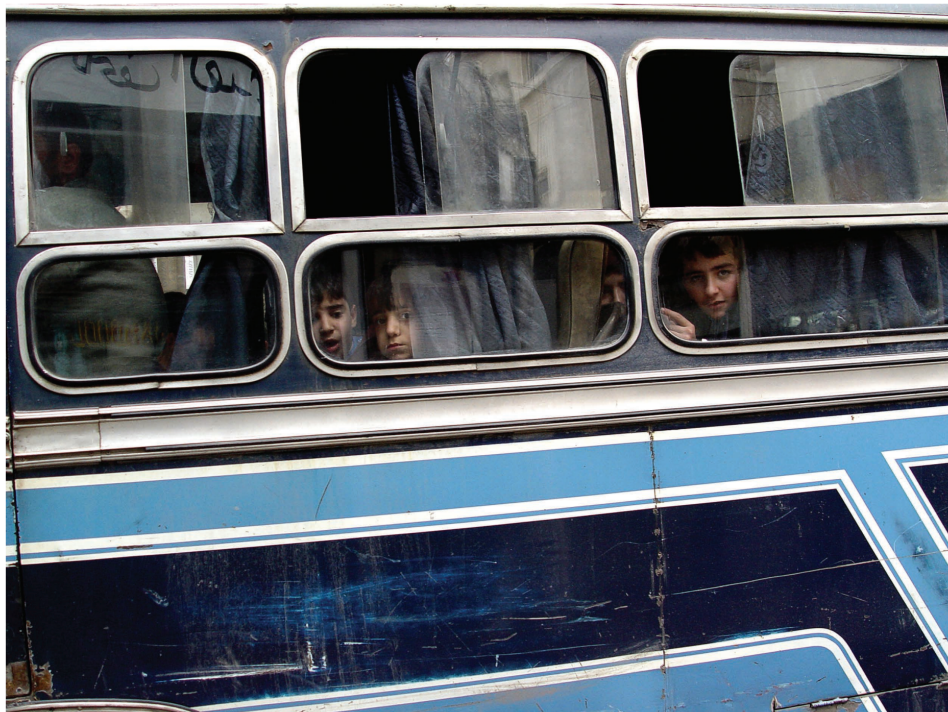
School Bus, Damascus, Syria, 2005

Naravno, dokumenti i kronike nikada nisu sasvim objektivni, već su po definiciji filtrirani kroz autorovu osobnost. Tako su slike gradova i ljudi, njihovih aktivnosti, običaja i životnog okruženja koje je Vlajković otkrivačije postale više od obične opservacije umjetnika. Dok je otkrivao nova mjesta, krećući se naprijed kroz prostor, Vlajković je shvatio da istovremeno putuje unazad - kroz vrijeme. Njegove su kronike počele bilježiti i unutrašnje putovanje: dok je išao naprijed prikupljajući vizualne repere, sve više je otkrivao paralele između stvarnog okruženja i