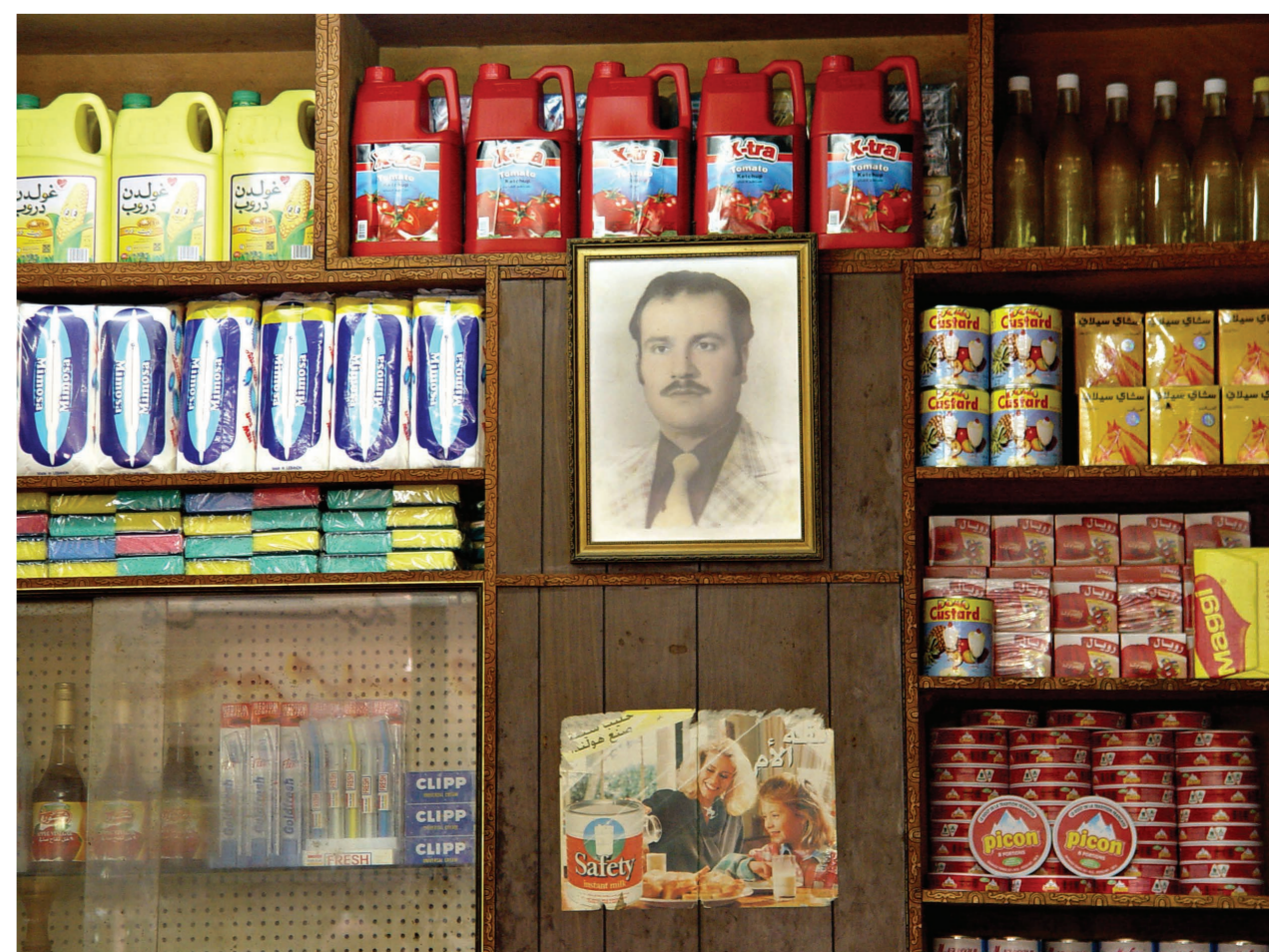
▲ Father Figure I, Tripoli, Lebanon, 2004