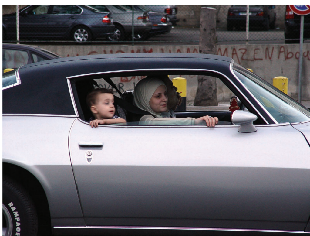
Rampage, Beirut, Lebanon, 2005

2014 Night Light , Cuadro Gallery, Dubai 2013 Nighthawks , Sikka Art Fair, Dubai 2012 Genius Loci , Sikka Art Fair, Dubai 2008 Foto8 Summer Exhibition , HOST Gallery, London